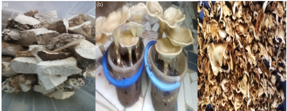
Fig. 1(a-c): Sclerotia and fruit body samples of the test mushrooms, (a) Crumbs of sclerotia of P. tuber-regium before inoculation, (b) Mature fruit bodies of P. tuber-regium in a plastic container and (c) Dried fruit bodies of P. ostreatus , ready for processing

were subsequently stuffed into heat-resistant bottles (HRB); tightly sealed with aluminium foil and autoclaved at 121°C and 15 psi for 30 min (Fig. 1b). The bottles were allowed to cool before they were aseptically inoculated with actively growing mycelia of the oyster mushrooms. They were subsequently incubated in the dark (at 27±2°C) until the grains were fully colonized by the mycelia 9 . The same protocol was followed for spawn multiplication 8,10 .